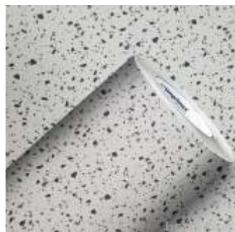
IX3778 Granilite Cinza