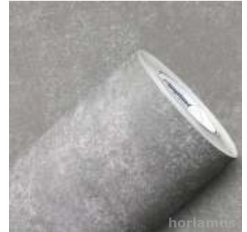
IX1723 Cimento Queimado 1801