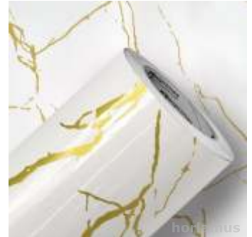
IX3770 Mármore Alba Imperial Gloss