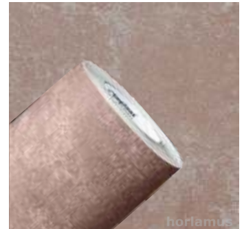
IX1724 Cimento Queimado Terracota