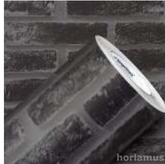
IX1676 Tijolo Mescla Cinza