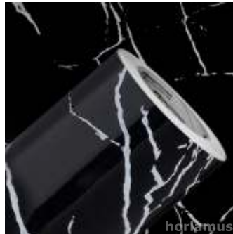
IX3771 Mármore Luna Gloss