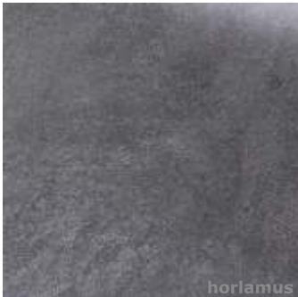
IX3773 Ardósia Cinza Escuro