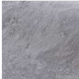
IX3774 Ardósia Cinza