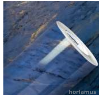
IX1667 Mármore Azul Macaúba