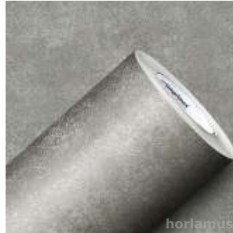
IX1722 Cimento Queimado Grafite