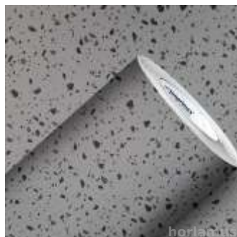
IX3779 Granilite Cinza Escuro