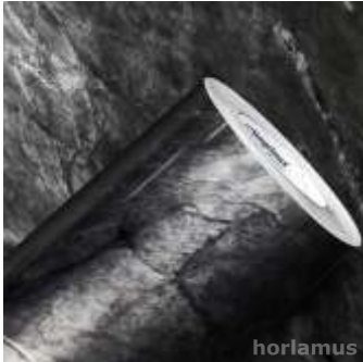
IX1669 Mármore Silver Black Gloss