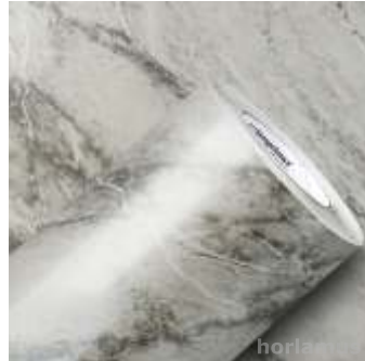
IX1666 Mármore Carrara Gloss