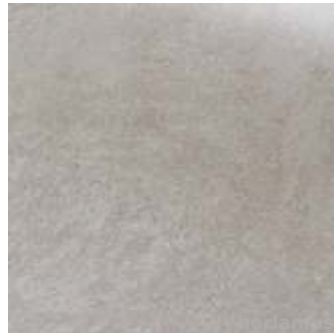
IX3775 Ardósia Areia