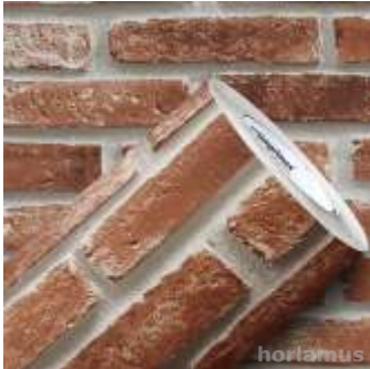
IX1721 Tijolo Vermelho 1801