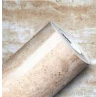
IX1671 Mármore Travertino Gloss