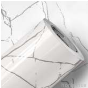
IX3769 Mármore Alba Gloss